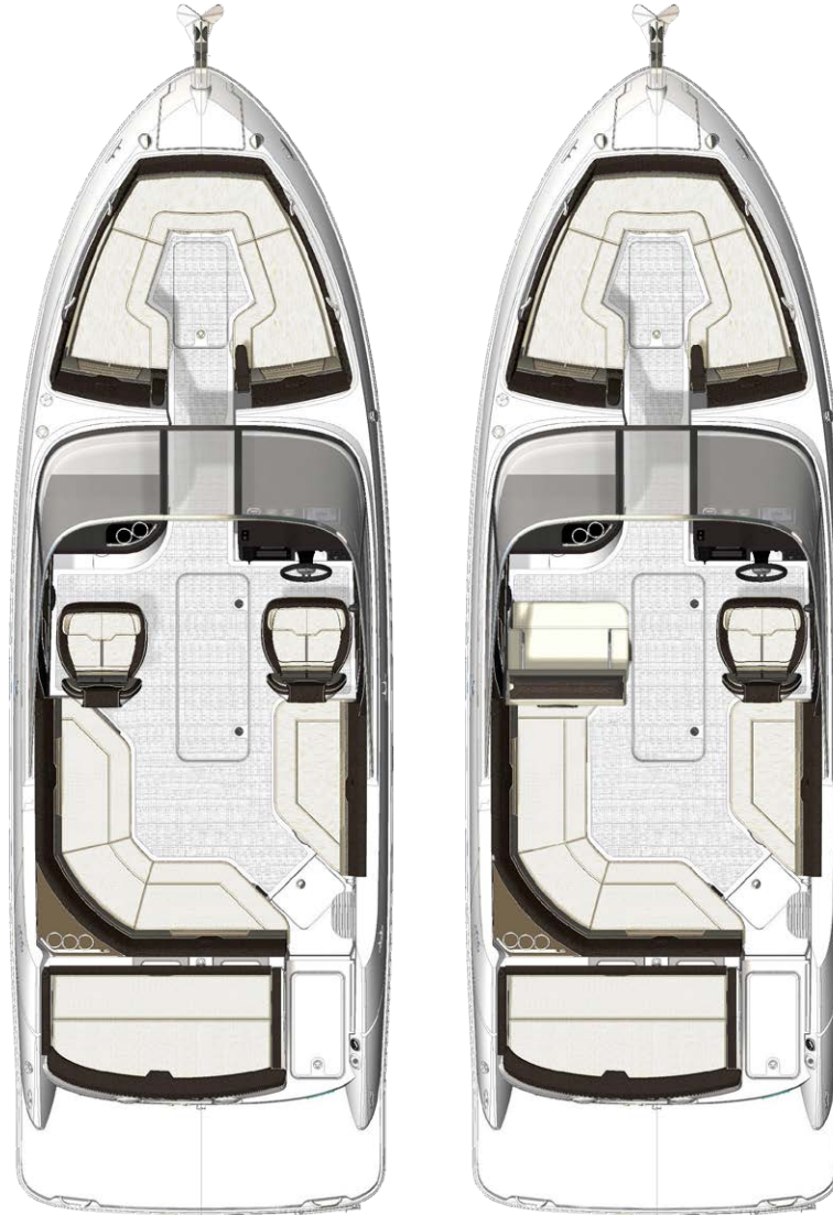
STANDARD TWO BUCKET SEATS